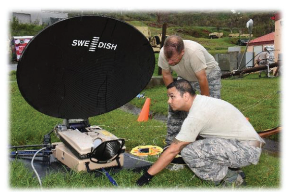
cyber defense and mitigation activities, and increase interoperability among responders while reducing response times.

The ANG has 62% of the AF communications capability. Field representatives from the ANG addressed operational shortfalls and proposed updated communications capabilities to improve the ANG's ability to respond quickly and function efficiently during emergency operations in support of civil authorities, federal, and state partners. The capabilities identified improve the security of communications devices and networks, support