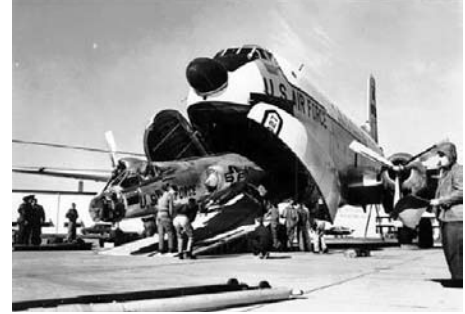
F-104 Starfighter, dismantled and being loaded for transport.

The original plan was for the squadron's fighters to cross the Atlantic by flying from Knoxville to Argentia, Newfoundland, and from there to Lages in the Azores before continuing on to Germany, but there was concern as to the safety and feasibility of such a crossing since the F-104 was a single-engine aircraft. F-104 engines were known to suddenly quit mid-flight