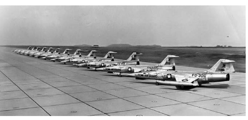
F-104 Starfighters from the 151st Air National Guard, their "TENN AIR GUARD" markings still in place.

The Starfighter had its origins in a 1950 Air Force requirement for a "high performance, multipurpose fighter." The design evolved into an "air superiority weapon," one that could destroy enemy aircraft in the air and dominate airspace. By 1956,