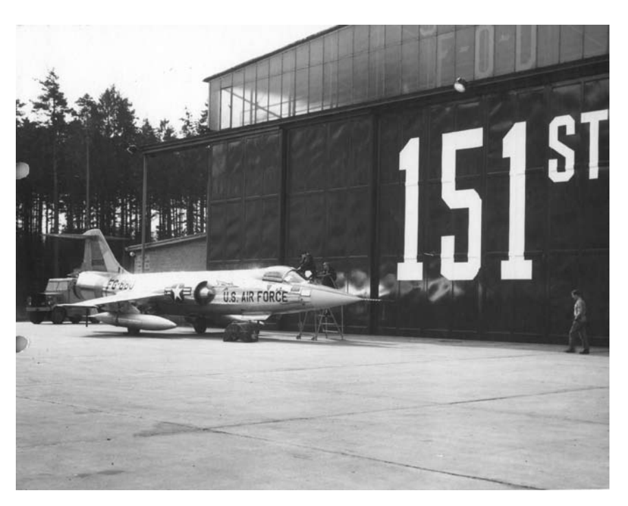
F-104 Starfighter in front of the 151st hanger at Ramstein Air Base, now with USAF markings.

<sup>32</sup> USAFE, vol. 1, ch. 3, figure 10. This did not compare well with the other two ANG F-104 squadrons in Europe, who achieved 72 and 98 percent of their scheduled hours. Ibid.