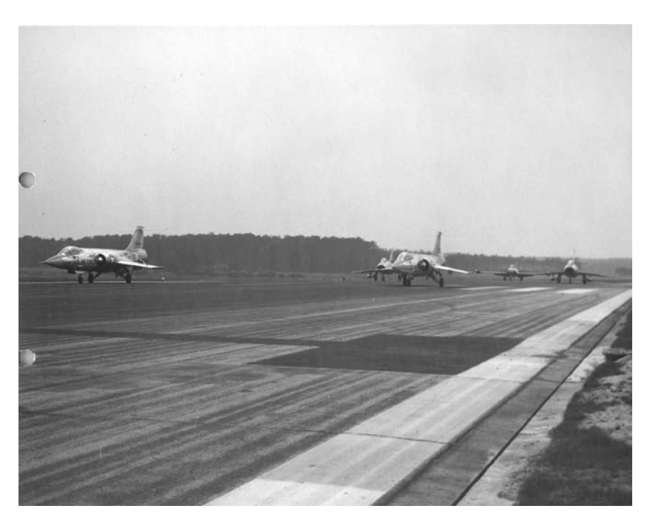
F-104 Starfighter from the 151st landing at Ramstein, accompanied by a French Mystere IV.

Back in the states, the commander of Air Defense Command had already endorsed the Air National Guard's capabilities, calling it "an integral part of our total