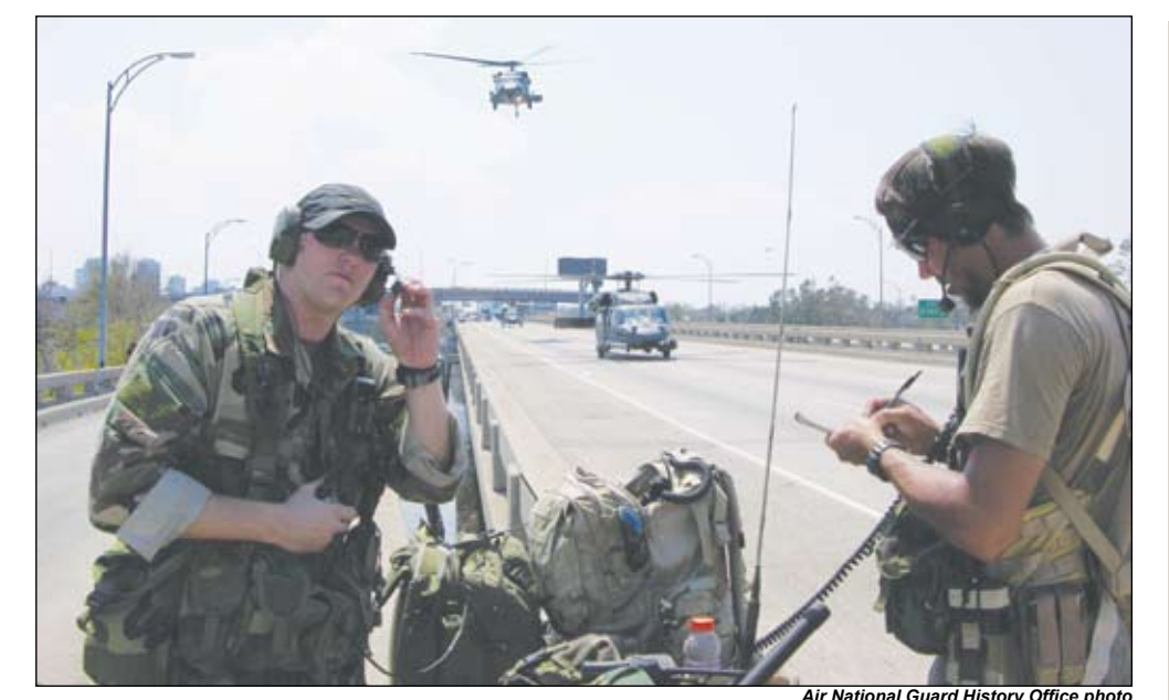
Combat controllers work at a makeshift landing zone evacuating victims of Katrina.

In Jackson, Miss., rescue crews from the